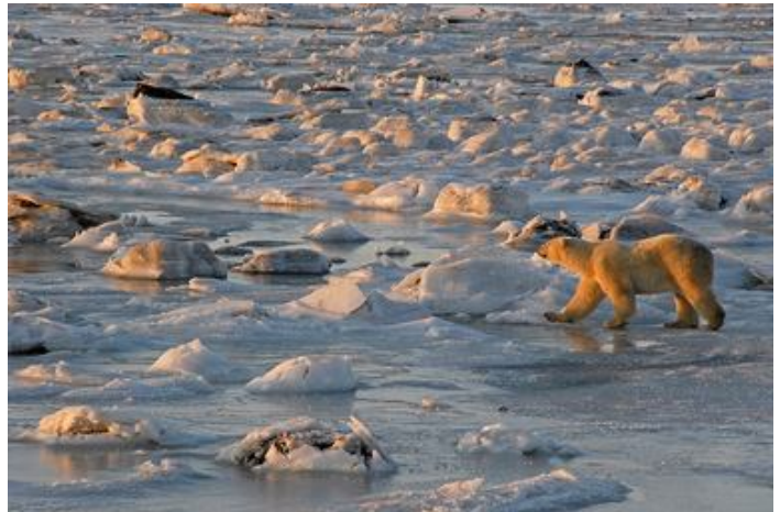
Title: Polar Life

Location: Samburu National Reserve, Kenya