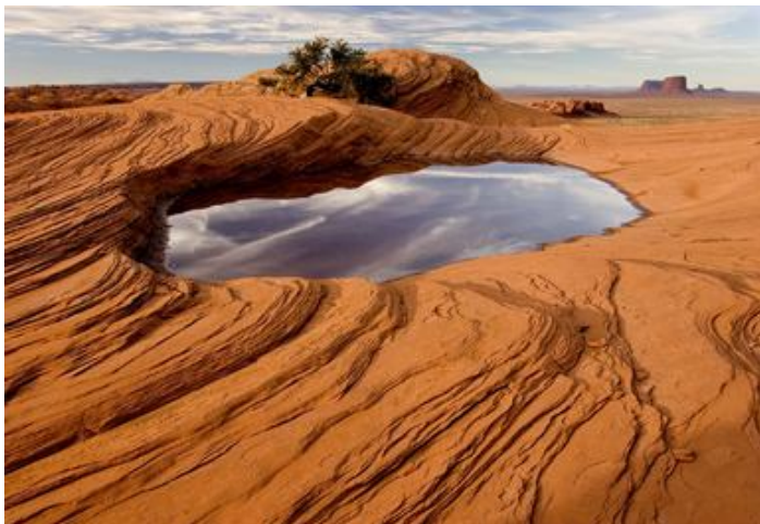
Title: Mystery Valley Cloud Pool Location: Monument Valley, Arizona