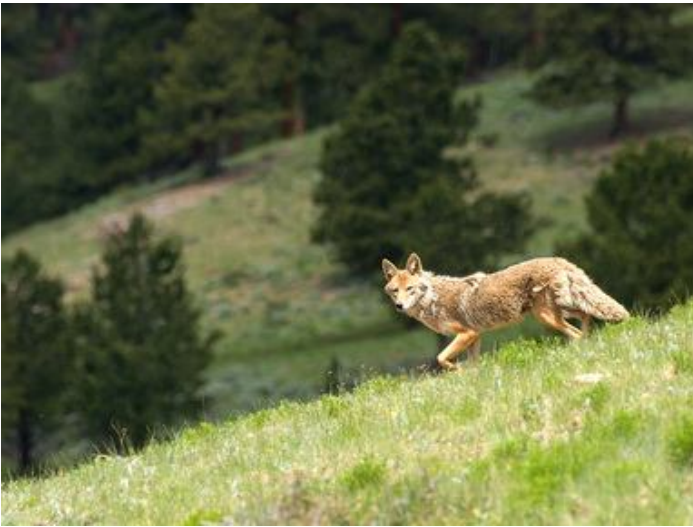
Title: Coyote in Habitat