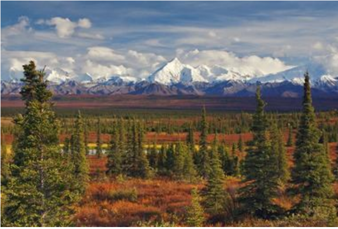
Title: Fall Color in Denali National Park