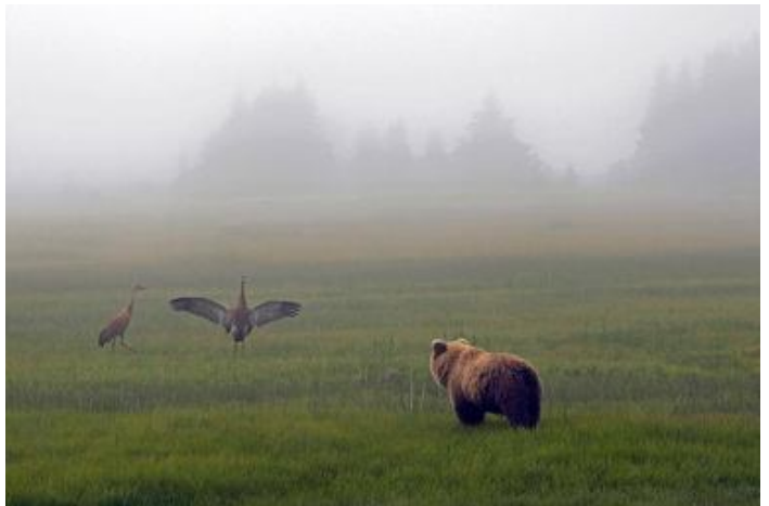
Title: Washington Coast Sunset

Description: Coastal grizzly watching sand hill cranes in a courtship dance