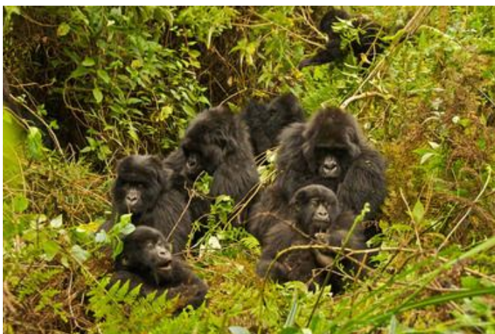
Description: Seven members of a mountain gorilla family are grooming and relaxing together