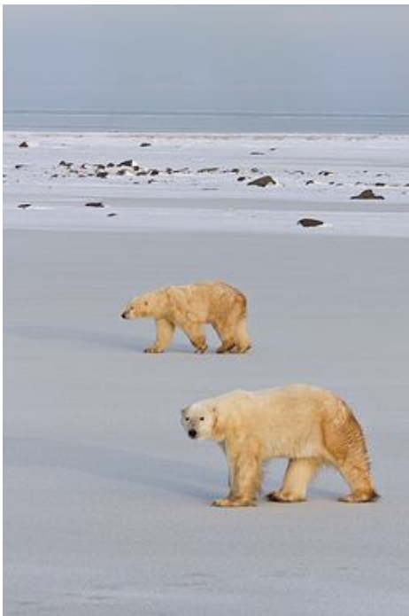
Title: Line of African Elephants