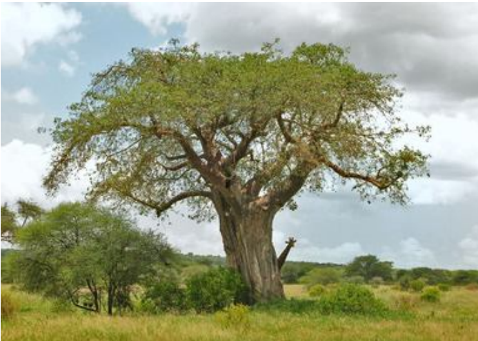
Title: Baobab with Peeking Giraffe