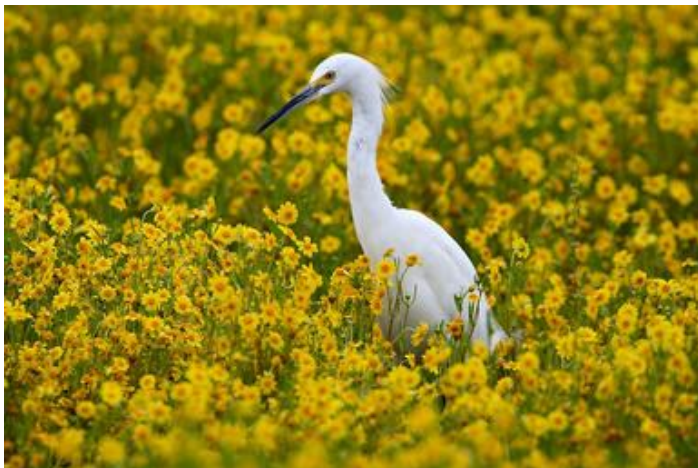
Title: Snowy Egret in Wildflowers