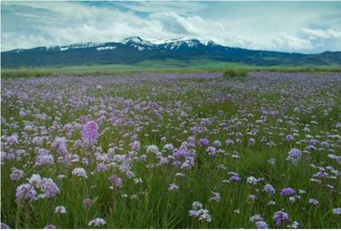
Title: Carpet of Flowers