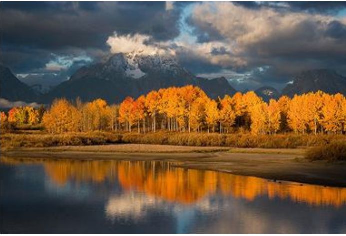
Title: Oxbow Magic