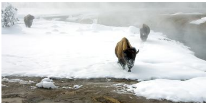
Title: Chilkat River

Description: Bison forage in Yellowstone National Park near the warm waters of the rivers that flow through the park