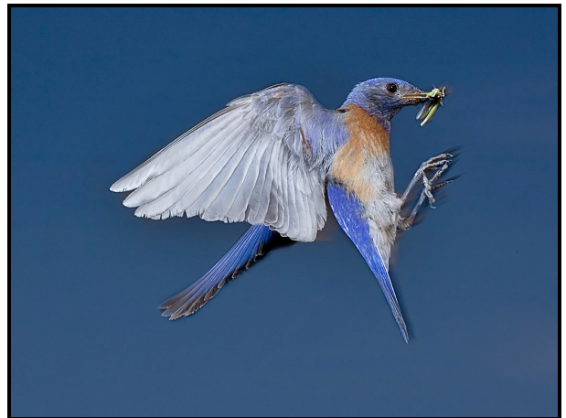
1 st Place Bluebird with grasshopper Chuck Summers

2 nd Carmine bee-eater Charlie Summers 3 rd Southern Elephant Seal James Hager HM Yellow Warbler Nancy Stocker HM Coyote and pups Robin Wilson HM Wood duck ducklings Fi Rust