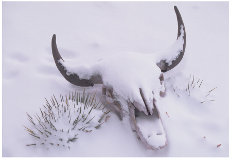
1 st Place Buffalo Skull in Snow Reb Babcock