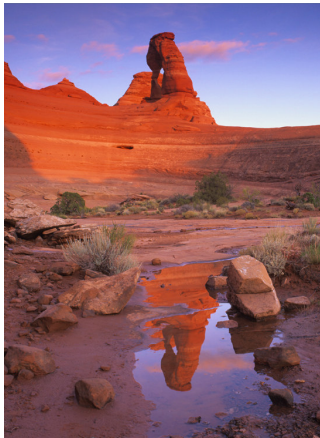
1 st Place Delicate Arch Reflection Reb Babcock