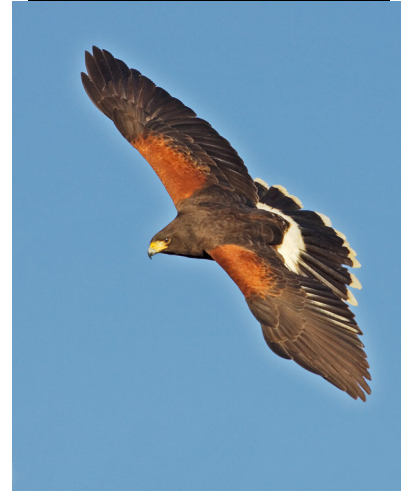
1 st Place Harris Hawk in Flight Fi Rust