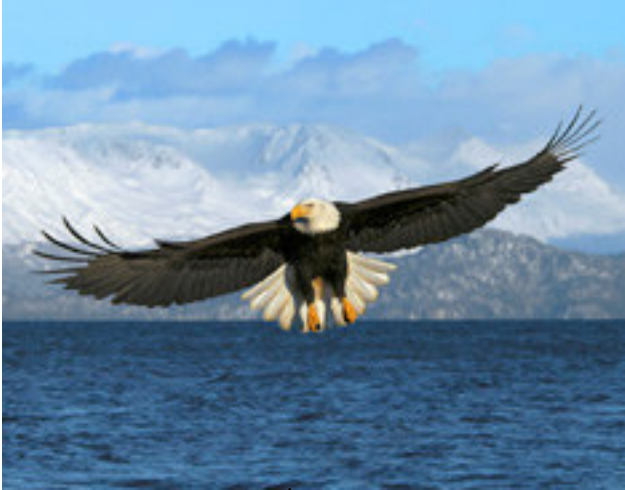
1 st Place Full Spread Sam Fletcher